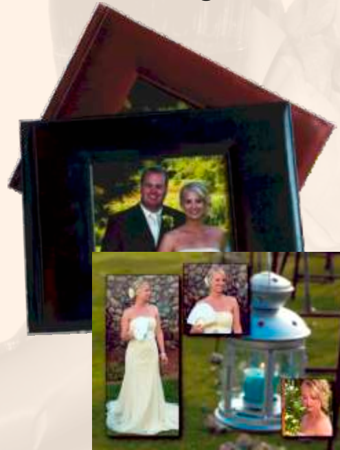
Sample single Platinum Album page.

The leather-covered Platinum Album is 12" high by 15" long. Its 20 pages will help you remember your wedding day story. Please visit our website to see sample pages of the platinum album.