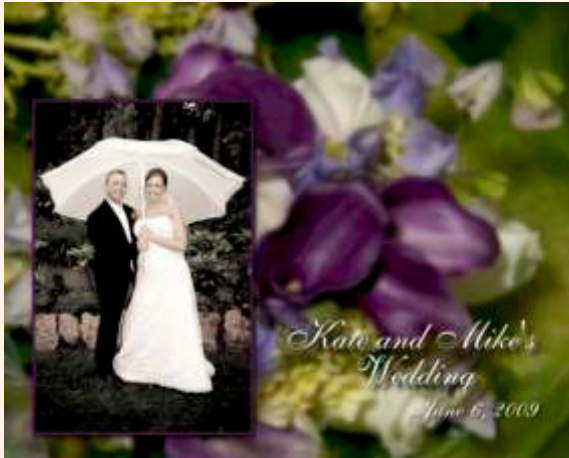
Sample single Gold Album page.

The Gold Album is a beautiful 20 page album created on a premium luster paper. The Album is 8" high and 10" long. It can contain 80+ pictures arranged in a wedding story fashion. It comes with a black leatherette cover. This albums allows you to pack a lot of pictures into a nice sized table-top album.