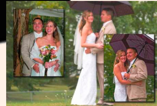
Sample Diamond Album double page.